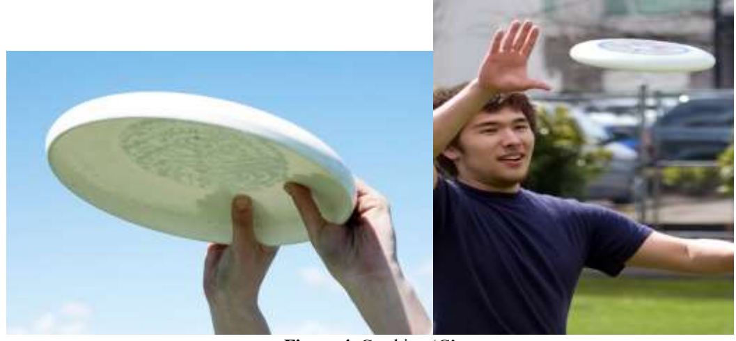
Figure 4. Catching 'C'

Another way of catching is 'C' catching ( Figure 4 ).